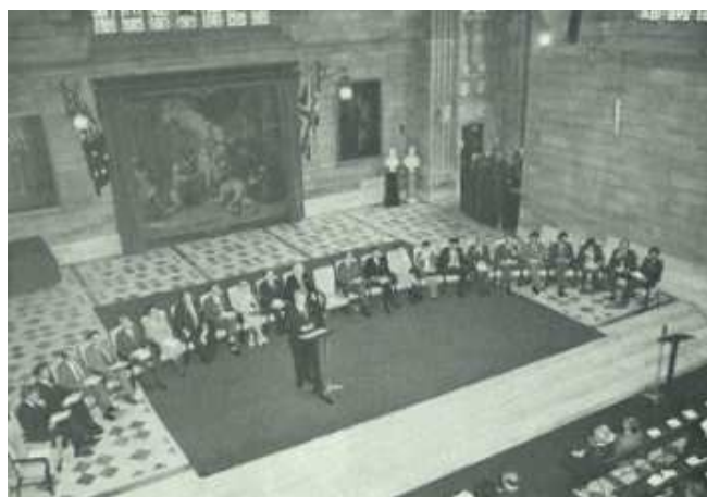
Figure 5. The Closing Ceremony at the University of Sydney.

Of the 1148 technical papers programmed, 964 technical papers were presented at the Congress. During each morning of the Congress, 17 disciplinary Sections were organised on subjects ranging from traditional topics, such as mineralogy, petrology, palaeontology and stratigraphy, to more modern research areas, such as marine geology, planetology and database development/mathematical