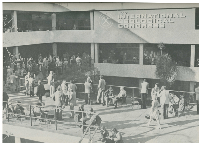
Figure 2. 25 th IGC Headquarters – The Carslaw Building, University of Sydney.