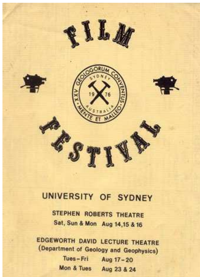
Figure 7. Cover of the 25 th IGC film programme.