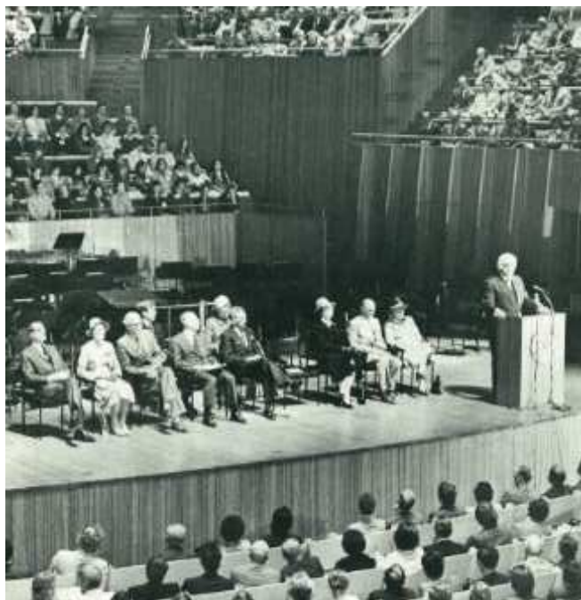
Figure 3. The Governor General of Australia, Sir John Kerr, addresses delegates at the Opening Ceremony of the 25 th IGC in the Sydney Opera House.

to open the Congress. Some members demanded withdrawal of the invitation, whilst others argued that the IGC had invited the ‘office’, not the man, and the offer should stand. The latter approach prevailed, but some Australian delegates refused to attend the opening ceremony, whilst there was also a significant on-site protest when a number of delegates (presumably Australian) rose from their seats and pointedly walked out of the ceremony as the Governor-General rose to speak. Many Australian delegates also recall that the Governor-General, having enjoyed a very good pre-opening lunch and accompanying libations, then proceeded to open the International “Geographical” Congress! That “gaffe” and his less than adequate speech were followed but not ameliorated, as one recorder notes, by a “second, much longer and very dull speech by a prominent geological writer”!